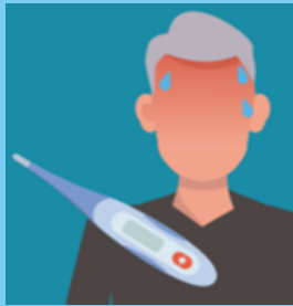
Tak linh/ khuasik