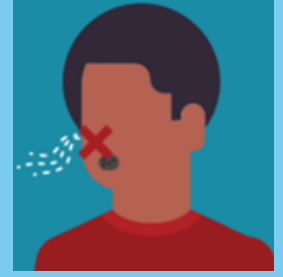
Thilrim le thil a thawtnak theih lo