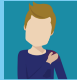
Thabatnak/ taksa fahnak